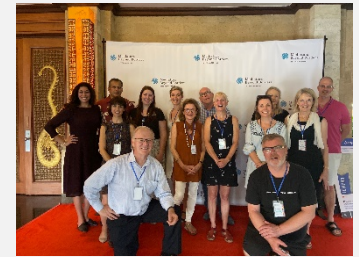
the energetic chapter convenors

The good news is that the MBB Oceania team has not been idle this year, there is much useful progress to report.